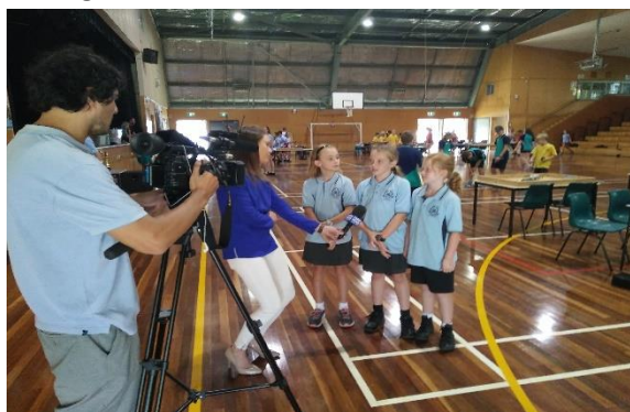
Well done Johns River Mechanics!

They were sitting in first place after the first round but were unfortunately let down by a battery that would just not charge during the drag race. Despite this, they still managed to win 2nd place overall for the day which is an outstanding effort - especially with all but one student competing for the first time. The Mechanics also took out the "Design" award which is based on robot design and performance during the challenges.